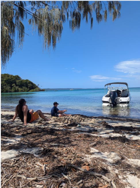
Relaxing on Peel Island