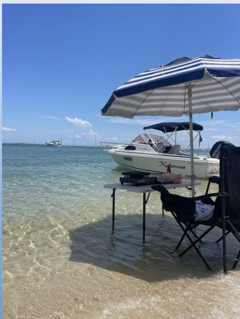
Another angle of Peel Island